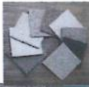
Rugs Carpets Pelts