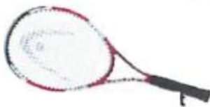
Tennis Racket Strings